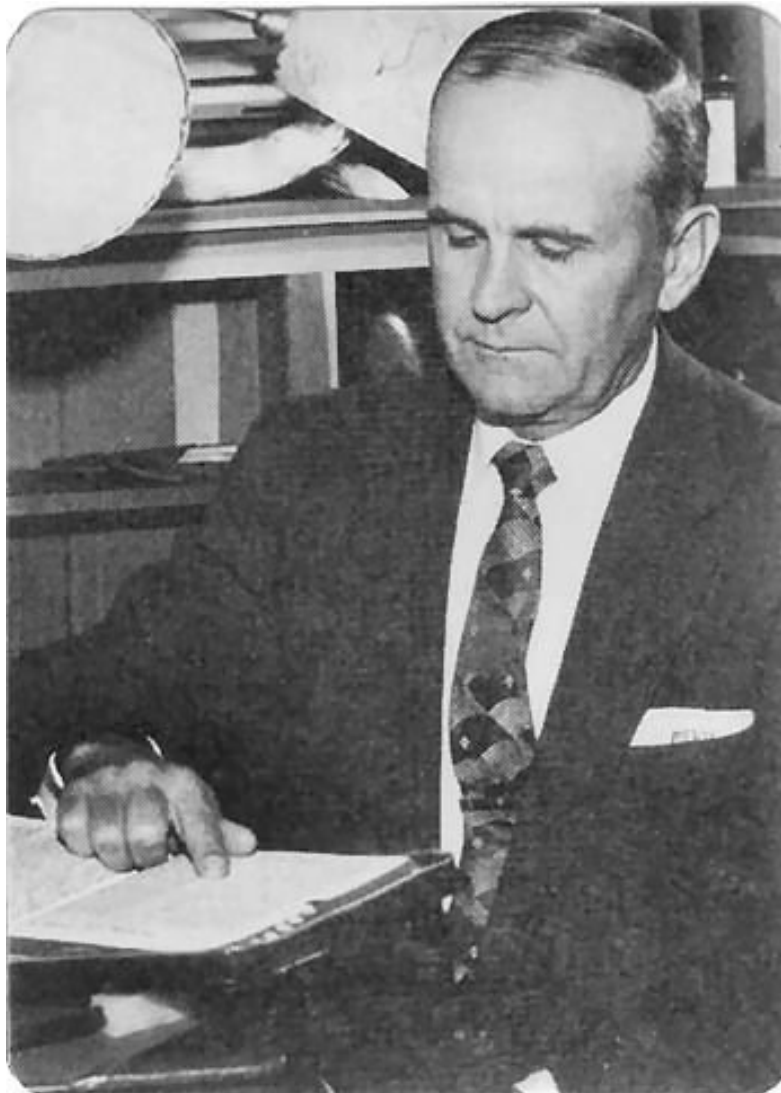
William Marrion Branham

Behold, I will send you Elijah the prophet before the coming of the great and dreadful day of the LORD: